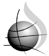
INTERNATIONAL COMMISSION OF JURISTS